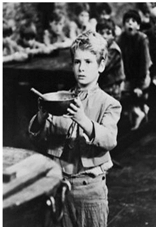
"Please, Sir..." (and Madam)

Funds raised will cover the costs of Phase 1 of the refurbishment and, we hope, Phases 2 and 3, without the need to ask for more. Who wants to do that?