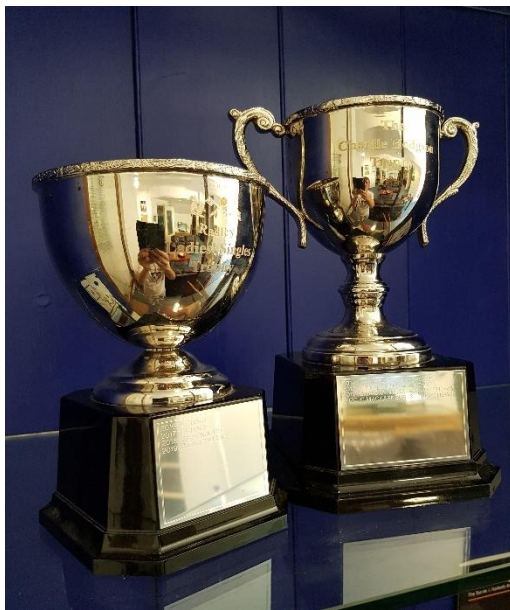
The RCTC Ladies Singles Trophy and the Charlie Hodgson Trophy for Handicap Doubles

The events to be included are: The Charlie Hodgson Trophy, a.k.a. 'The Hangover Doubles'; the Club Doubles; the Club Handicap Singles; the Ladies' Singles; and the Men's Singles competitions).